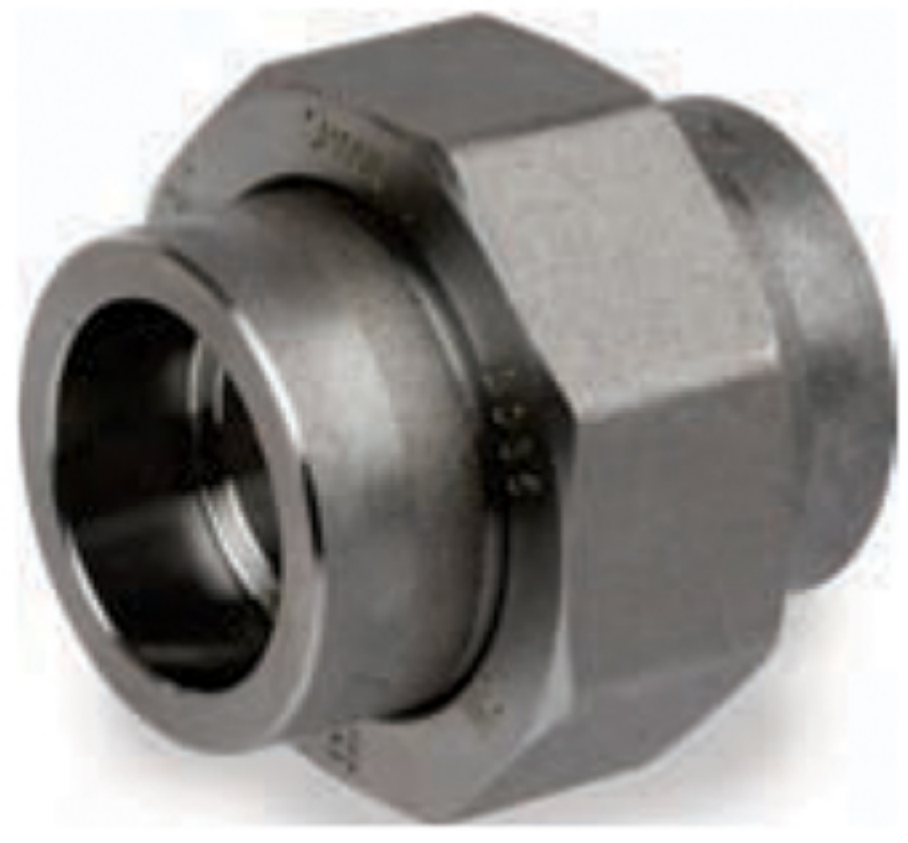
Fig. 52U 3 – Union